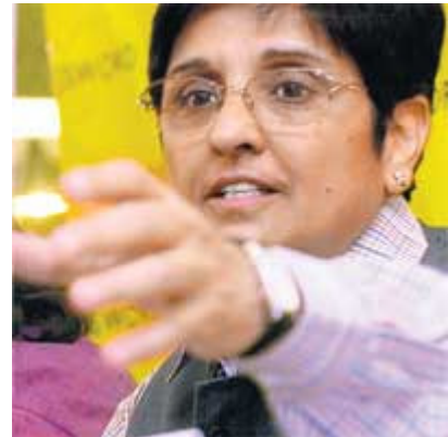
Kiran Bedi is currently the director general of Home Guards

When contacted, Bedi said she would react to the opposition later. "Right now," she says, "I am down with viral [fever]. But I will definitely answer this later." Bedi is scheduled to retire in 2010.